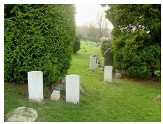
Radnor Street Swindon

Hear about the work of the Commonwealth War Graves Commission and how it manages and cares for the memorials, cemeteries and headstones in 23,000 locations across 150 countries. Their heritage estate covers horticulture too – looking at the cemeteries, monuments and all the gardens and landscape together – and taking a conservation-based approach to how best to look after these in the future.